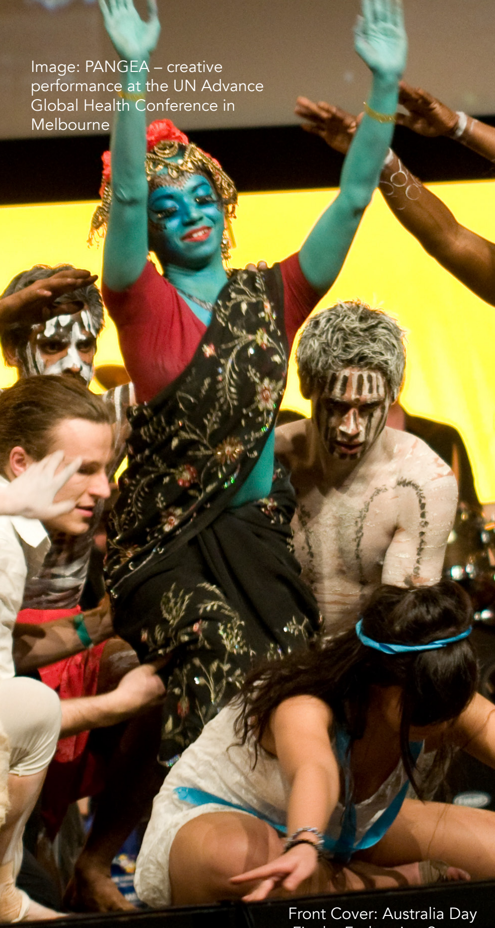
Image: PANGEA – creative performance at the UN Advance Global Health Conference in Melbourne

Front Cover: Australia Day Finale, Federation Square