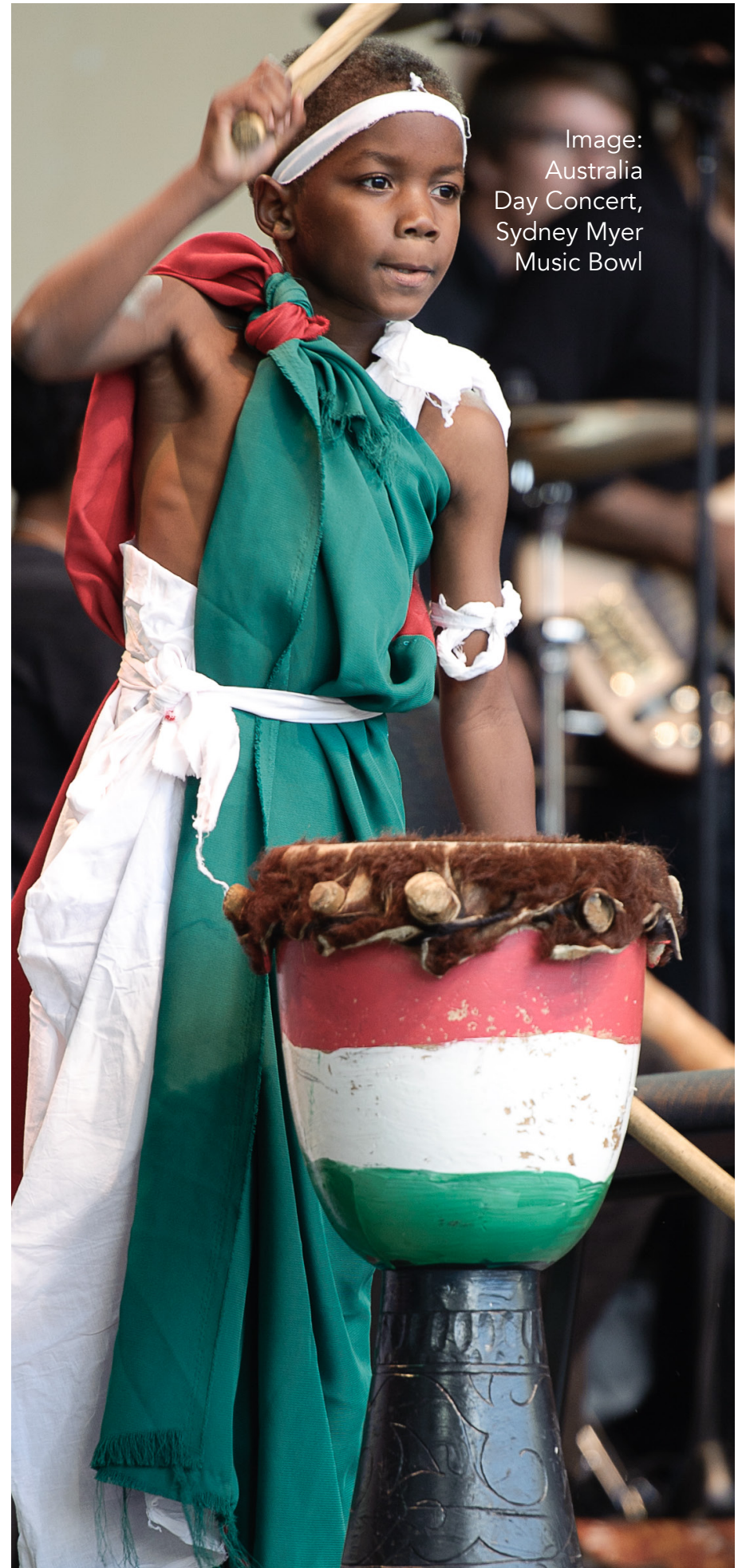
Image: Australia Day Concert, Sydney Myer Music Bowl

Melbourne Millennium Eve Celebrations • Olympic Games 2000 – MCG Olympic Football Tournament • Melbourne MOOMBA Waterfest Parade • SBS Federation Square Opening Celebration • XIX International Congress of Genetics • Davis Cup Media Launch – Rod Laver Arena • Australia Day Celebrations – Federation Square • Opening & Closing Ceremony – International Congress of Psychiatry • Parliament of the World's Religions – Opening & Closing Plenaries • United Nations Global Conference for Health