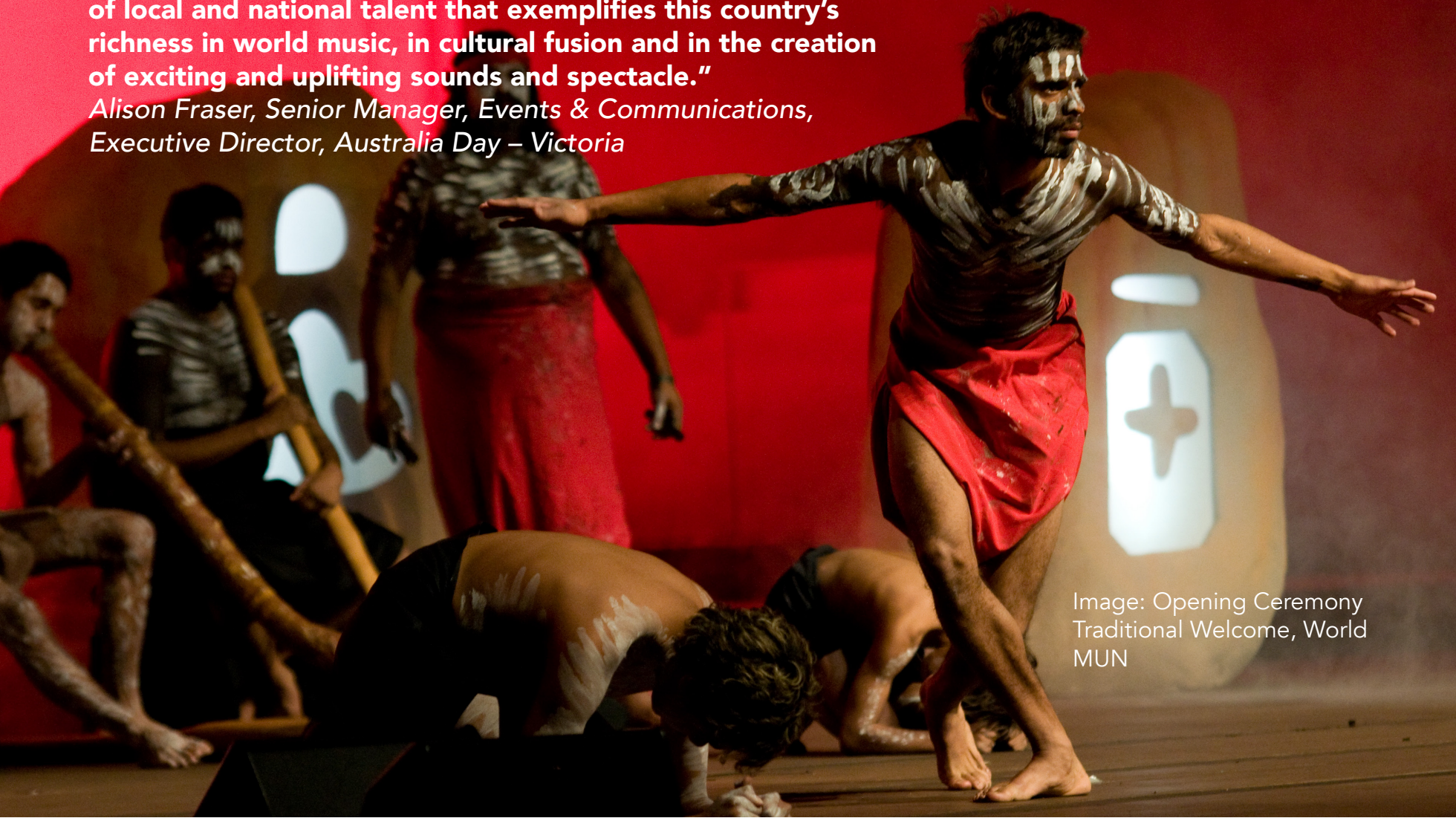
Image: Opening Ceremony Traditional Welcome, World MUN